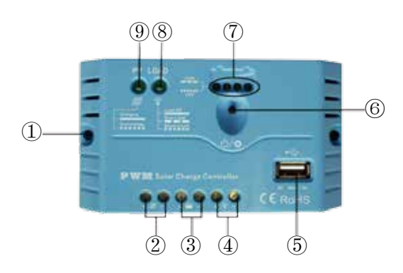
Figure 1 Product Feature